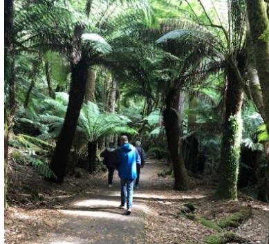
Trowutta Arch on the Tarkine Drive

Our arrival in Tasmania saw us in a colder climate than we had anticipated but the climate didn't deter us from enjoying the wetter North West Coast and the Tarkine Drive before deciding that the East Coast was looking a more warmer climate to continue our travels.