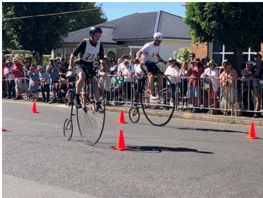
Evandale Penny Farthing race